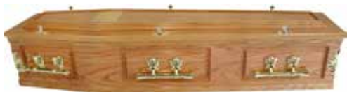
Surrey – Solid Oak (also available in Mahogany) £845