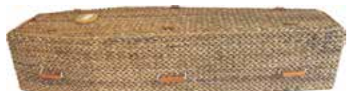
Banana Leaf – Coffin shape* (also available in Casket shape*) £995