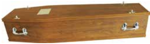
York – Oak Effect Foil Veneer £445