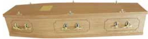
Rochester – Oak Veneer £520