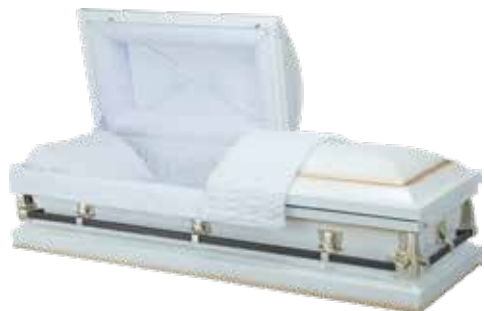
American-Style Caskets* American-style Caskets are available in wood or metal in a wide selection of designs From £1,470