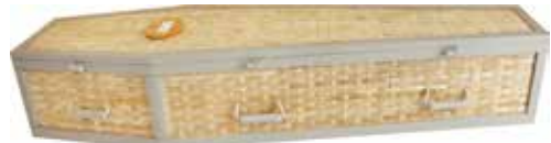
Premium Bamboo* £720