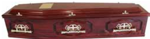
Windsor – Semi-Solid Mahogany (also available in Oak) £720