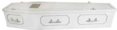
Oxford White – White Painted Veneer (also available in a range of colours - £720) £670