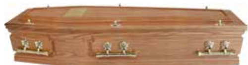
Westminster – Solid Oak (also available in Mahogany) £865