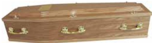
Worcester – Oak Veneer (also available in Mahogany) £595