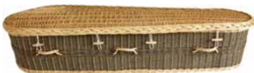
Personalised English Willow (Wicker) Hand-woven in Somerset, personalised to your specification £1,120